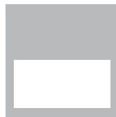
7.5" x 3.5"