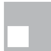
3.5" x 3.5"